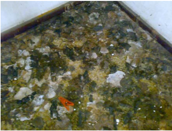
Cat feces everywhere in the house