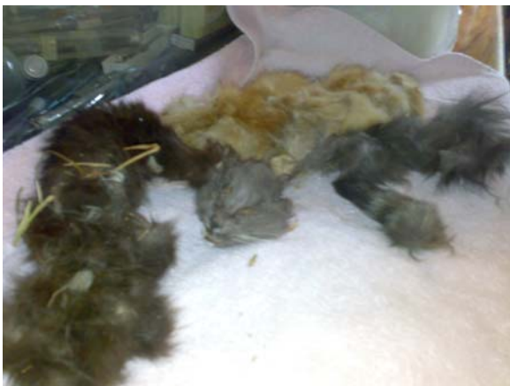
Heads, skins and tails from different cats

The next day, the Newlands police broke the lock on the kitchen door, giving us access to the house. Four more kittens were found inside the house, as well as more body parts of cats. This suggests that, cats either died of hunger and were eaten by the others, or cats have been slaughtered, or both! There was also the biggest mess inside the house any of us had ever seen. Rubbish and cat feces were covering the floors throughout the house.