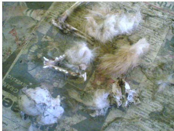
Skeletons and bones