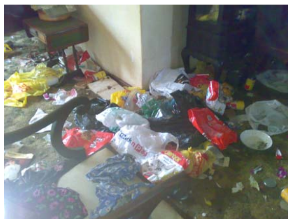
Rubbish in the living room