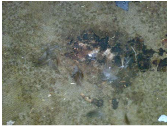
Skin, hair and dry blood on the main bedroom's carpet

We are still continuing rescue operation, however many factors are complicating the situation and therefore hampering our rescue attempts. We asked the Newlands police to arrange a meeting at the house with the old lady's son. He denies having anything to do with the cats dying at the house and also claims that they are all strays and do not belong to his mother. The police told us that they cannot investigate the case any further.