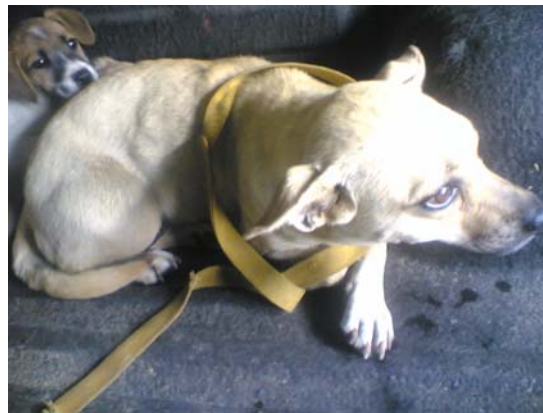
The twelve puppies left behind together with their mommy The mommy dog

Unfortunately, many dogs and cats living in squatter camps (and residential areas), are abandoned when their owners move away. We also discovered this abandoned mommy cat with her 3 four-week-old kittens , in Video Centre Squatter camp.