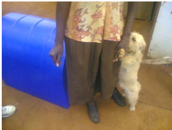
This doggie was very excited about her new kennel

FERAL CAT PROJECTS: Feral cats are a direct result of humans, not sterilising their cats, starting many years ago. Cats and kittens ended up on the streets, multiplying even more. We trap, sterilise and release ferals and urge people to feed them. Ferals cannot be re-located due to their nature and adult ferals are almost impossible to tame.