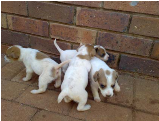
The puppies at 5 weeks old

To our surprise, her condition started to improve and got better every day. Three weeks later, she had made a full recovery!