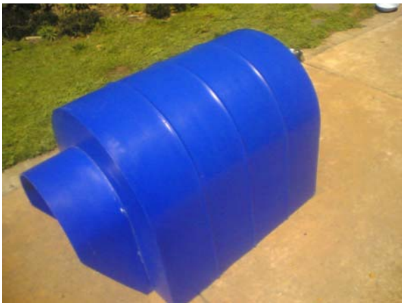
Our own “custom made” kennels, supplied by CHM Plastics