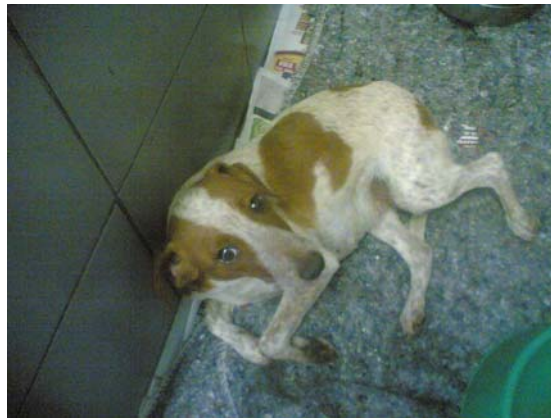
The mommy dog recovering at our vet

Fortunately both mommy and all her puppies found wonderful homes. Two of the puppies found a home with a friend of Bismarck du Plessis, the Springbok rugby player . Bismarck was only too willing to pose for us with the two pups!